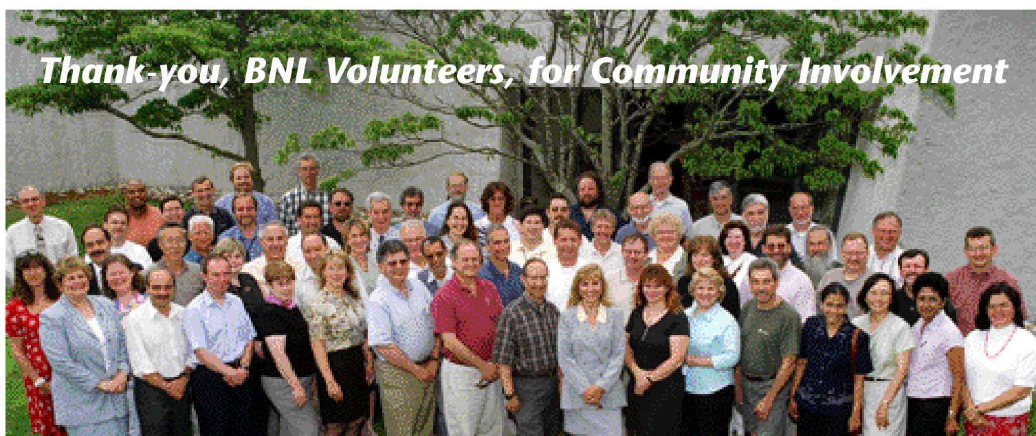
Photographed outside Berkner Hall are some of the many BNL volunteers who have given time to represent the Lab through programs such as the Ambassadors, the Envoys, Longwood Mentoring, Speakers' Bureau, and the Tour Program, most of which are grouped under the umbrella of the Community Involvement Office.